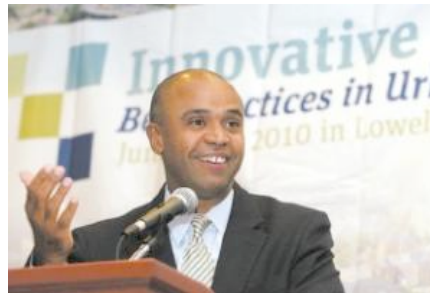
Adolfo Carrion Jr., former director of the White House Office of Urban Affairs, called smaller cities the economic engine of the nation.

Last night, keynote speaker Adolfo Carrion Jr., former director of